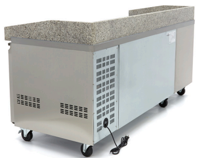
Extra powerful cooling system on the right side