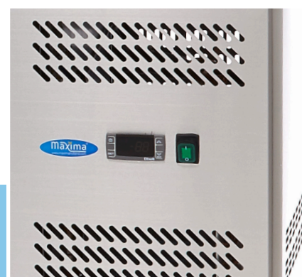
Dixell digital temperature controller