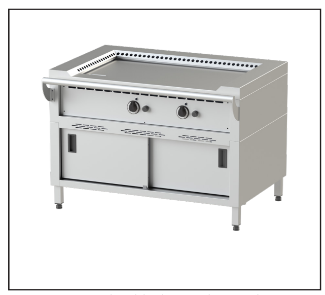
Due to continuous technical development, the image shown may not represent the latest design of the unit.