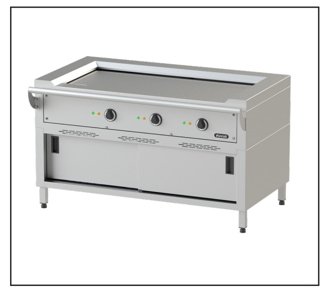
Due to continuous technical development, the image shown may not represent the latest design of the unit.