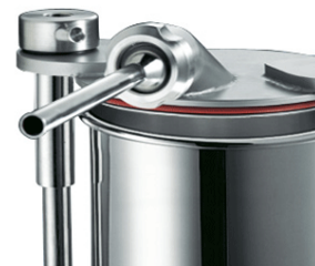
Optional s/s bush, optional