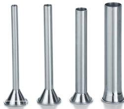
Funnels in s/s ø 13-16-20-38 optional