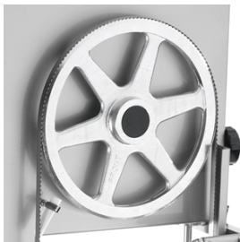
Hermetic upper pulley